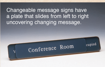
Changeable message signs have a plate that slides from left to right uncovering changing message.

Specialty requirements for room identification and control are accomplished with these unique frames. They feature built-in changeable messages, magnetic changeable signs and frames with dividers. Frames are fabricated from continuous anodized aluminum extrusion in nine standard colors: